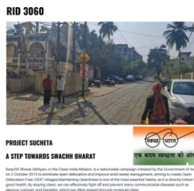
Project Sucheta In IRA Magazine.