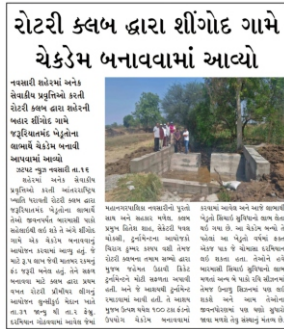
RCN's Permanent Project Check Dam @ Village Shingod in Zatpat News.

It also adds enthusiasm to the people working tirelessly to fulfill dreams & promises.