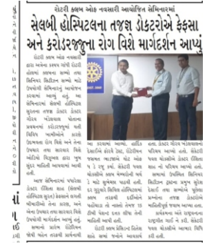
Speaker Meeting by eminent Doctors of Shalby Hospitals.