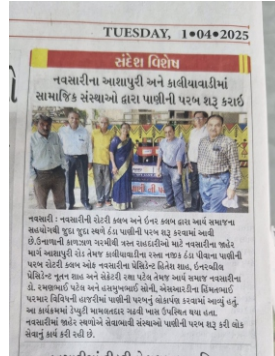
“પાણી ની પરબ” project in Sandesh newspaper.